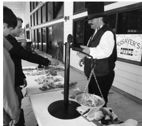
Trading Gold for Provisions