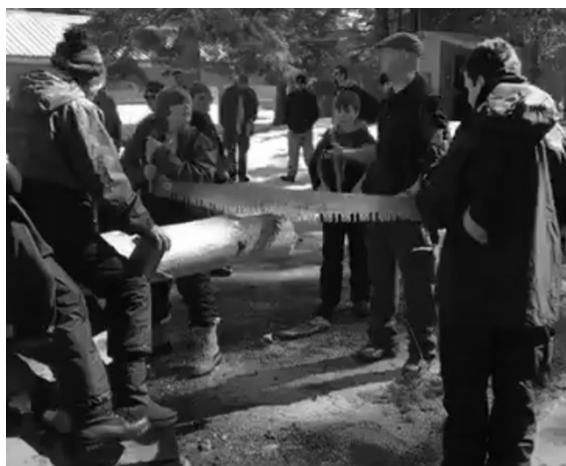
Cutting Logs at the Dawson Lumber Mill

Success at the Klondike Derby is all about preparation. We will do our best to help you prepare your unit for this Scouting adventure. The winter awareness training held in years past has now been made available in a series of short training videos that can be viewed at your convenience. We recommend that the unit leader, assistant unit leaders, senior youth leaders, and other interested scouts or parents review these training videos in the weeks leading up to Klondike. They contain valuable information that will help you prepare for an overnight snow camping outing. You can find all of the training videos at www.seqbsa.org/klondike-derby/ .