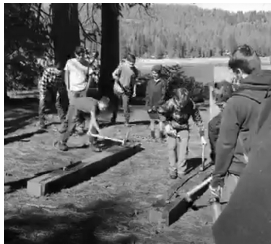
Driving Spikes at Caribou Crossing

Register online at www.seqbsa.org/klondike-derby/ .