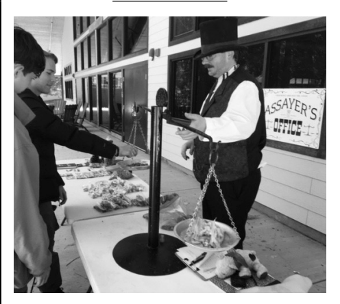
Trading Gold for Provisions