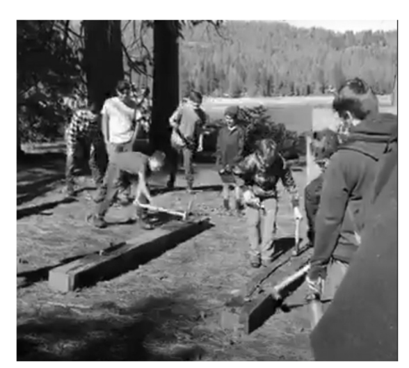
Driving Spikes at Caribou Crossing

Register online at <a href="https://www.seqbsa.org/klondike-derby/">www.seqbsa.org/klondike-derby/</a>.