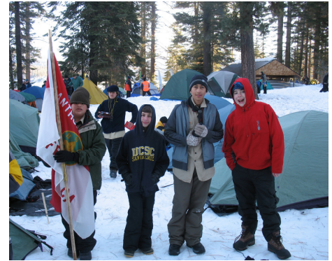
Patrols at Klondike use Scout skills while competing in events

Troops, Teams and Crews from around California are invited to participate in this winter adventure. Camp Chawanakee will be transformed into the Alaskan Yukon where Scouts will be traversing the frontier, going from town to town testing their scout skills, competing for gold, and demonstrating the Patrol Method. Start planning now for a great Scouting adventure!